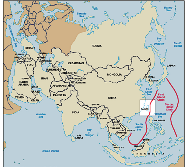
First and Second island chains at East Asian island arcs.

Taiwan is now one source of contention between the U.S. and China. As is often said but