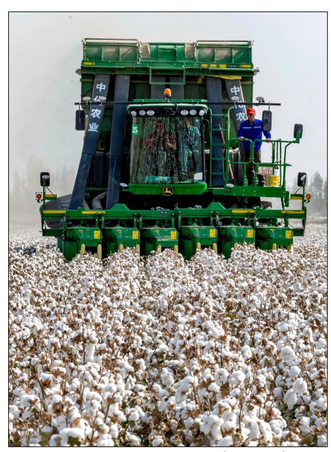
Modern cotton harvester in use. (Picture ma)

The plenary session also conveyed to the world China's clear position of deepening reforms and advocating an open world economy,