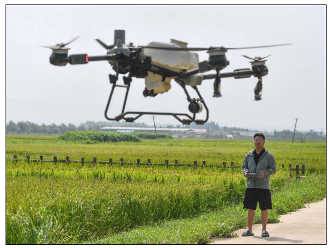
Agricultural innovations.

China and Switzerland have strong economic complementarities and a broad scope for cooperation, with huge potential for both in traditional and emerging industries, such as the green economy, the digital economy, life sciences and other areas. China continues to promote high-quality development and a high level of opening to the outside world, offering foreign companies numerous opportunities for cooperation and development, as well as a streamlined, transparent and predictable business environment for investment and operations. We welcome Swiss companies to seize the "China opportunity".