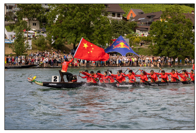
Chinese team at the dragon boat race in Eglisau, June 2024.

It is a pleasure to get to know different histories, cultures, traditions, living environments and lifestyles. At the same time, I have found that the Swiss and the Chinese share many characteristics, such as being very hardworking, valuing honesty and sincerity, and placing a high value on family and friends. These impressions of me are shared by many Swiss friends. It gives me