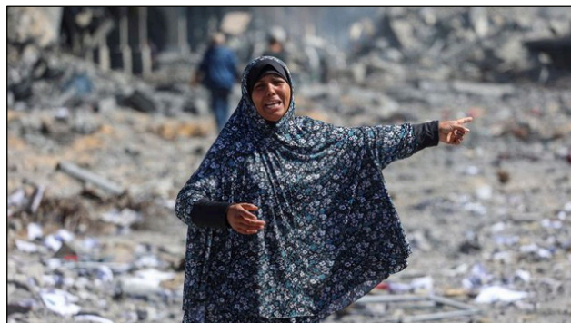
14 March 2024. Israeli army bombs house in Al Bureij refugee camp, Gaza Deir al Balah. At least nine members of a family are killed, including five children.

If nothing changes, there is a risk of famine in the northern Gaza Strip, warned the deputy director of the World Food Program (WFP). At least 576,000 people in the coastal strip are affected by “catastrophic deprivation and hunger”, added the Deputy Director of the UN Humanitarian Aid