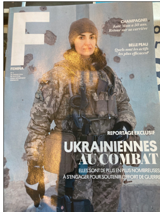
Femina, no. 4, 28 January 2024. (Picture ma)

Can this world really be taken seriously? On entering the heated arena, Cabrel's bull raises its head. 2 The bullfighter looking at him is none other than a dream woman dressed from head to toe in a soldier's uniform. You would think she was posing in front of the camera of a major Hollywood production. The cover of the current issue no. 4 of the magazine "Femina" 3 devotes an entire dossier to these "Ukrainian women in