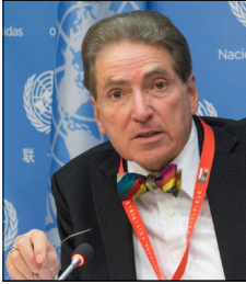
Alfred de Zayas. (Picture ma)

A detached observer who wants to assess where countries stand on fundamental issues of human rights, international law, peace, development and multilateralism need only look at the voting record of States at the United Nations Security Council,