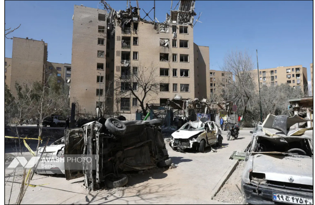
Damage inflicted on a Tehran neighbourhood.

General Assembly, Human Rights Council and other international agencies.