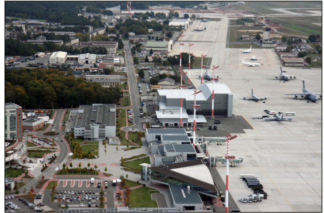
US Ramstein Air Base.

For this reason, the German government – and indeed all German governments since the 1950s – have been implicated in US wars via the Ramstein operations centre. Insofar as these involve wars of aggression and “pre-emptive” killings by drones in violation of international law, the German governments are thereby violating the German Basic Law. In Article 26, it prohibits acts that disrupt the peaceful coexistence of peoples. For decades, German governments have responded to all complaints from Parliament and civil society accusing the executive of criminal acts with evasive answers and the flimsy justification that the government’s complicity cannot be legally proven. Many legal experts, however, regard the German government in the Ramstein case as an accomplice to serious violations of international law.