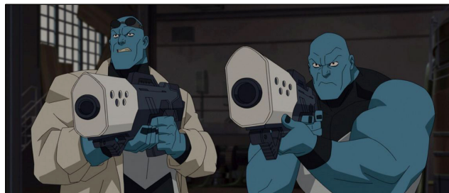
“Enough talking.”

In this range of topics, one looks in vain for the most important prerequisite, especially with regard to global environmental issues: the pursuit of peace and understanding. The never-ending wars since 1945 not only create endless suffering for the people affected, but also permanently destroy the environment – see the use of Agent Orange to defoliate the forests or the condemnable use of geoengineering to turn the triangle