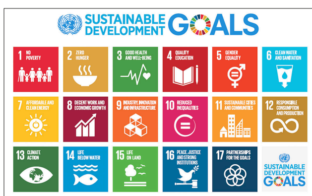
The 17 sustainable development goals of the UN-Agenda 2030. 30

Since the beginning of June 2020, the WEF has been “selling” a technocratic-digital utopia as the solution to all problems with an elaborate, international propaganda campaign under the name “The Great Reset”. But already in 2015, under the guise of “sustainable development”, the 2030 Agenda was conceived at the UN and adopted by the member states. On 13 June 2019, WEF founder Klaus Schwab and UN Secretary-General António Guterres signed a partnership between the two organisations. The first item of this agreement regulates – unsurprisingly – the funding of the UN 2030 Agenda by the WEF.