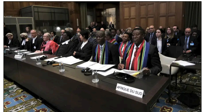
Hearing in the case against Israel on suspicion of genocide at the International Court of Justice on 11 January 2024.

Second , the application provides a substantial body of evidence showing that Israeli leaders have genocidal intent toward the Palestinians. (p. 59–69) Indeed, the comments of Israeli lead-